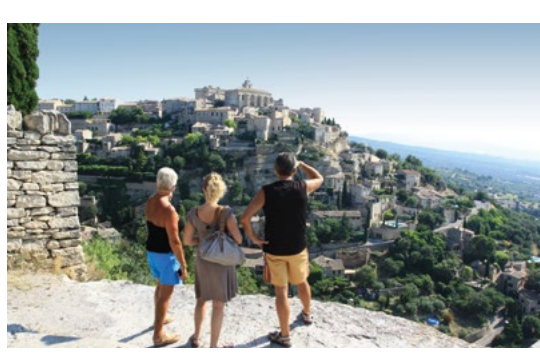
1 Rocher Bel Air